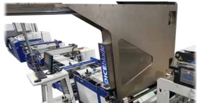
DICEblade Monochrome mounted over existing equipment